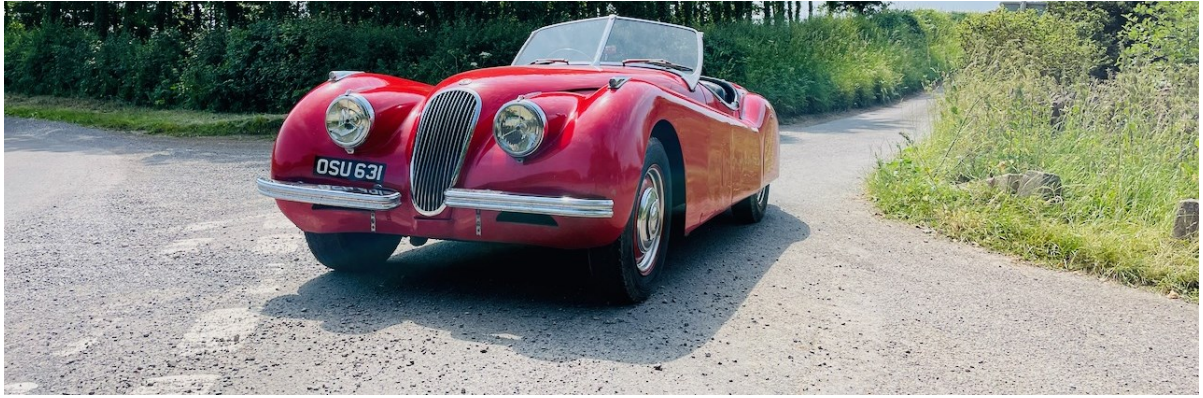
1951 Jaguar XK120 OTS RHD