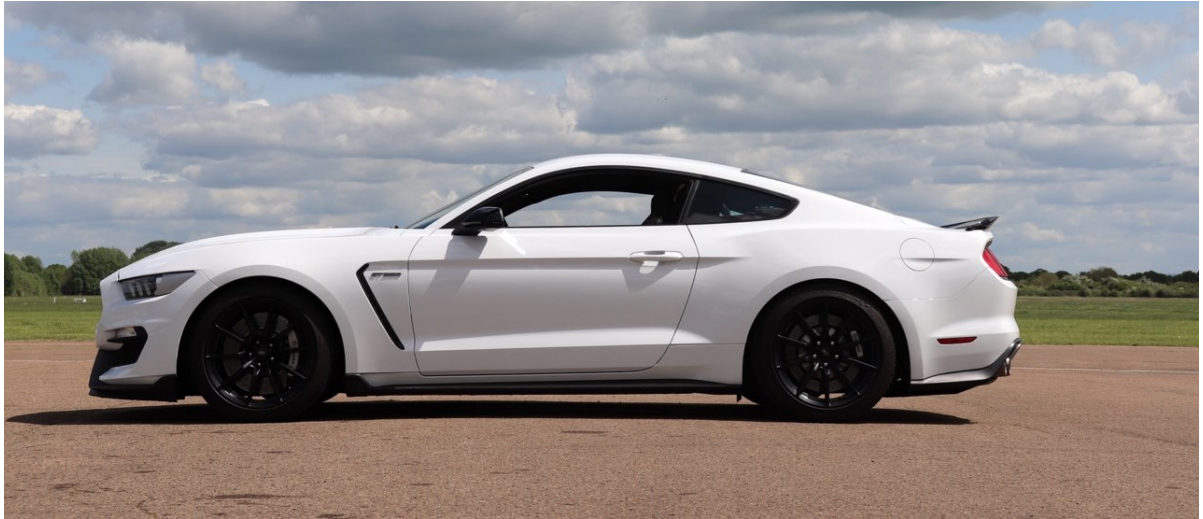
2016 Shelby GT350 Sold