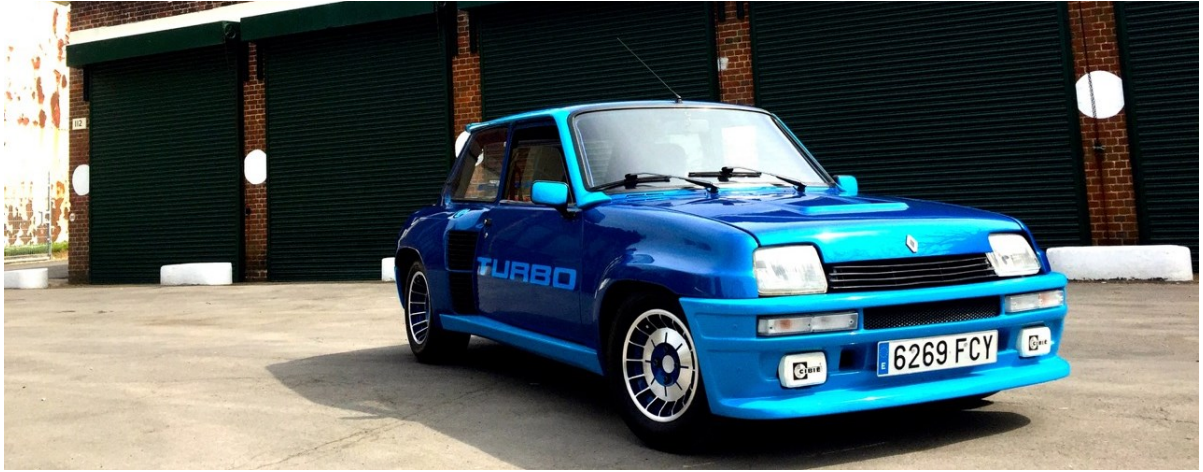
1981 Renault 5 Turbo 1