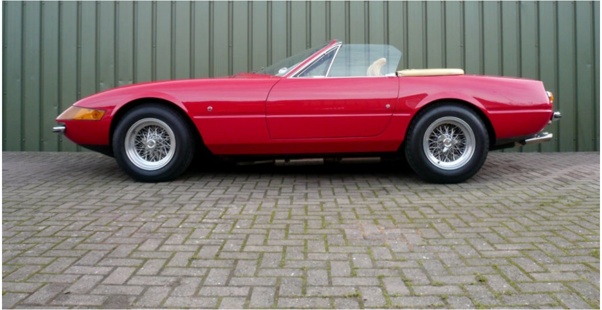
1973 Ferrari Daytona Spyder