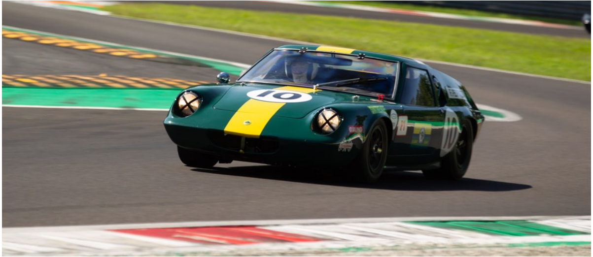
1967 Lotus 47GT Sold