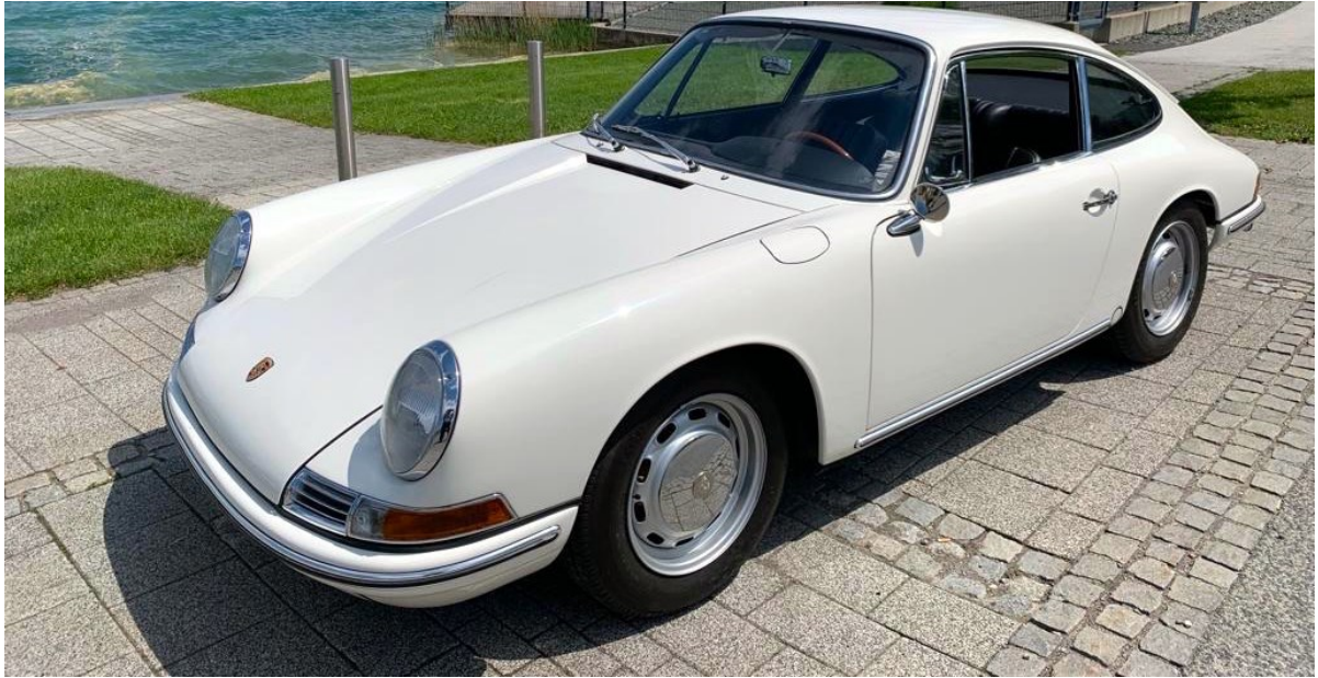
1966 Porsche 911